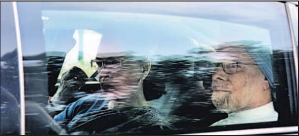
■ Congress president Sonia Gandhi and former PM Manmohan Singh arrive at Tihar to meet P Chidambaram on Monday.

Chidambaram, 74, was arrested on August 21 by the Central Bureau of Investigation (CBI) for alleged corruption in the grant of Foreign Investment Promotion Board (FIPB) clearance to INX Media. “The visit by Gandhi and Singh to Tihar jail was to send a strong message that the party stands firmly behind Chidambaram,” said a Congress functionary who did not want to be named. The Congress describes the arrest of Chidam-