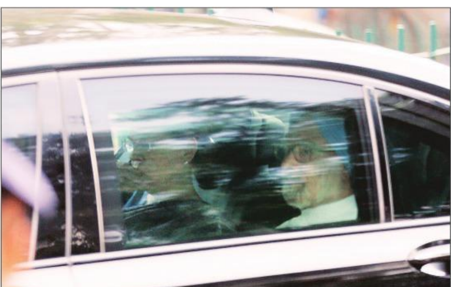
Former PM Manmohan Singh and Congress president Sonia Gandhi after meeting Congress leader P Chidambaram at Tihar Jail, in New Delhi on Monday.